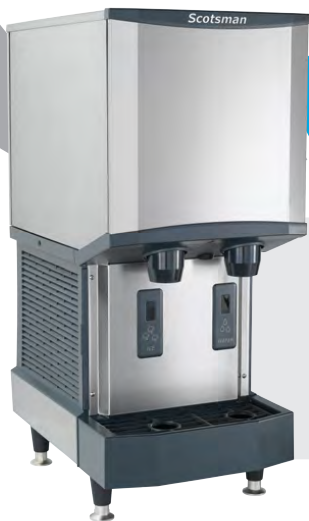
HID312A-1 with optional KLP24A legs

Sealed, maintenance-free bearings ensure maximum reliability and contribute to a long machine life